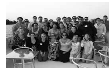
Potomac River Cruise, May 2009

Join the Clemson Club on May 15 for this exciting Potomac River Cruise, complete with a full buffet lunch (menu online), on-board DJ and tour guide! This is a great way to meet local Clemson alumni and learn about our nation's capitol - perfect for students and summer interns, young alumni, parents, and families! The boat will launch at noon from the Washington Marina