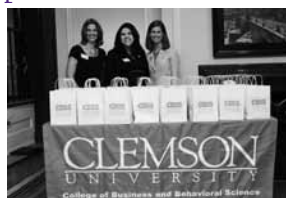
CBBS Reception, April 2009